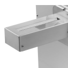
Optional pasta cutter