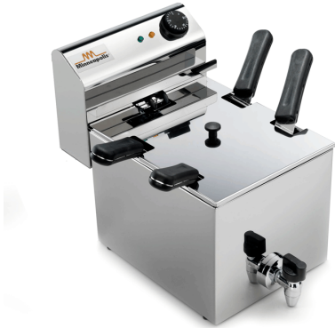
Sirman Pasta Cooker , model Pasti' 8 :