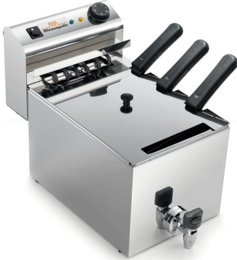
Sirman Pasta Cooker , model Pasti' 10 :

Authorized Distributor: INNOVATIVE FOOD EQUIPMENT 4/8 OLEANDER DRIVE, SOUTH MORANG 3752 VICTORIA() TEL./FAX. 03 9436 4488 / 03 9436 4066 E-mail:paul@ifea.com.au