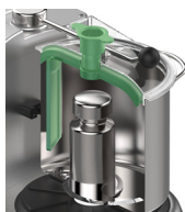
Scraper spatula for cleaning the tank and lid during processing