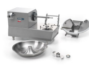
Katana 12 PTO