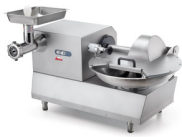
Katana 12 PTO TC