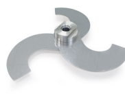
Optional: hub 3 blunt blades