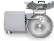
Katana 12 PTO