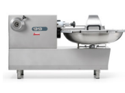
Katana 12 PTO