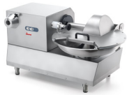
Katana 12 PTO