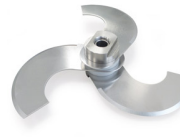
Optional: hub 3 blades