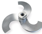
Optional: hub 3 serrated blades