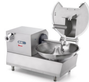
Katana 12 PTO