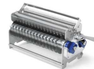
Cutting blade assembly