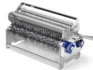
Tenderizing blade assembly with 96 blades