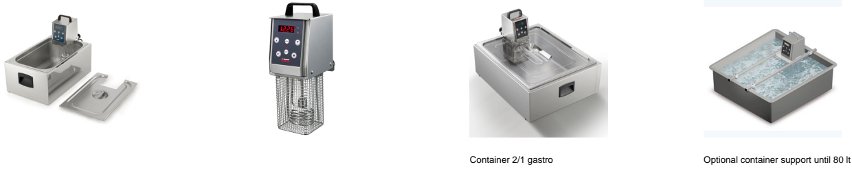
Container 2/1 gastro