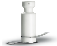
Shaft with knives to mix dough