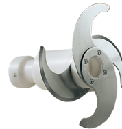
Shaft with knives for pesto sauce