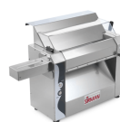
Sansone 42 with optional pasta cutter