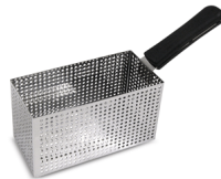
Optional Maxi basket