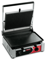
CORT L Timer