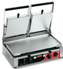
PD XX Timer