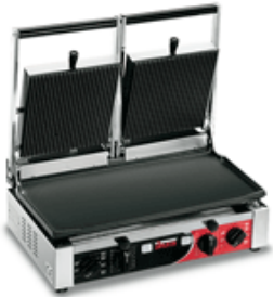
PD L Timer