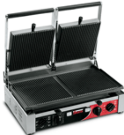
PD R Timer