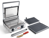
Cast iron plates removable