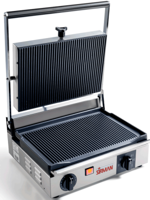
Sirman Panini Grills , model Cort PS :

Authorized Distributor: INNOVATIVE FOOD EQUIPMENT 4/8 OLEANDER DRIVE, SOUTH MORANG 3752 VICTORIA(A) TEL./FAX. 03 9436 4488 / 03 9436 4066 E-mail:paul@ifea.com.au