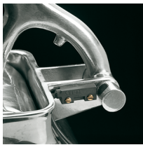
Microswitch on the grater

Strong machine, simple and compact, gives a high performance and power. It offers the possibility of grating cheese and bread with uniformity and without any waste. Structure realised in polished aluminium, treated steel roller anti-corrosive.