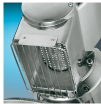
Protection grater / Stainless steel drum