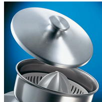
Lid - optional