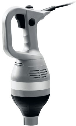
Sirman Hand Held Mixer , model Vortex 75 :