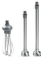
Shafts and Whisk