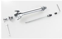
Removable knives and shaft