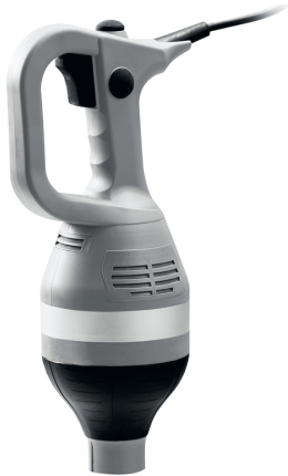
Sirman Hand Held Mixer , model Vortex 55 :