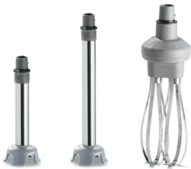
Shafts and Whisk