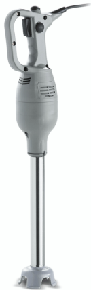
Sirman Hand Held Mixer , model Ciclone :